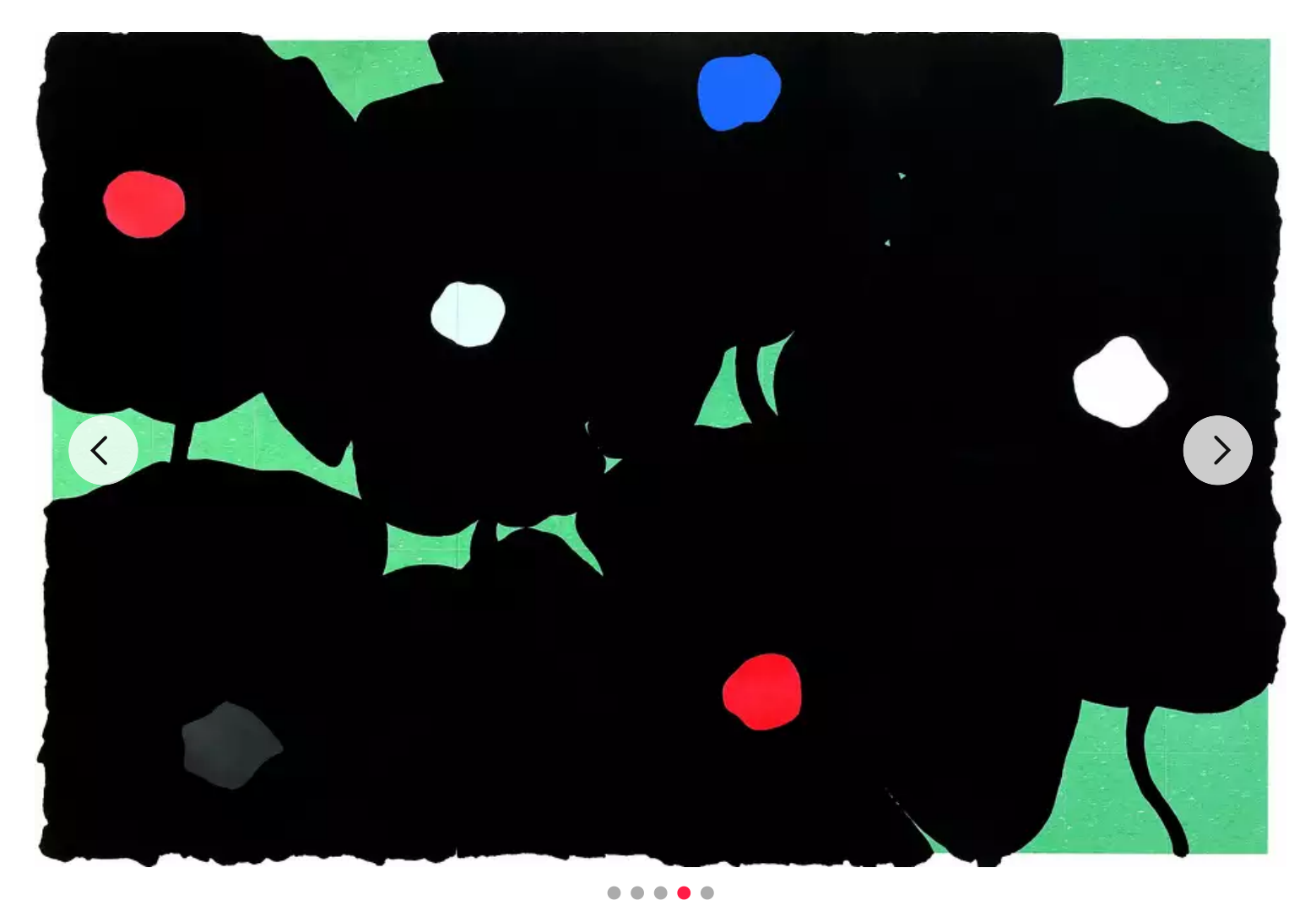
"Black and Colors Sept 2 2006" (2006) flock, enamel, tar and spackle on tile over Masonite by Donald Sultan \,