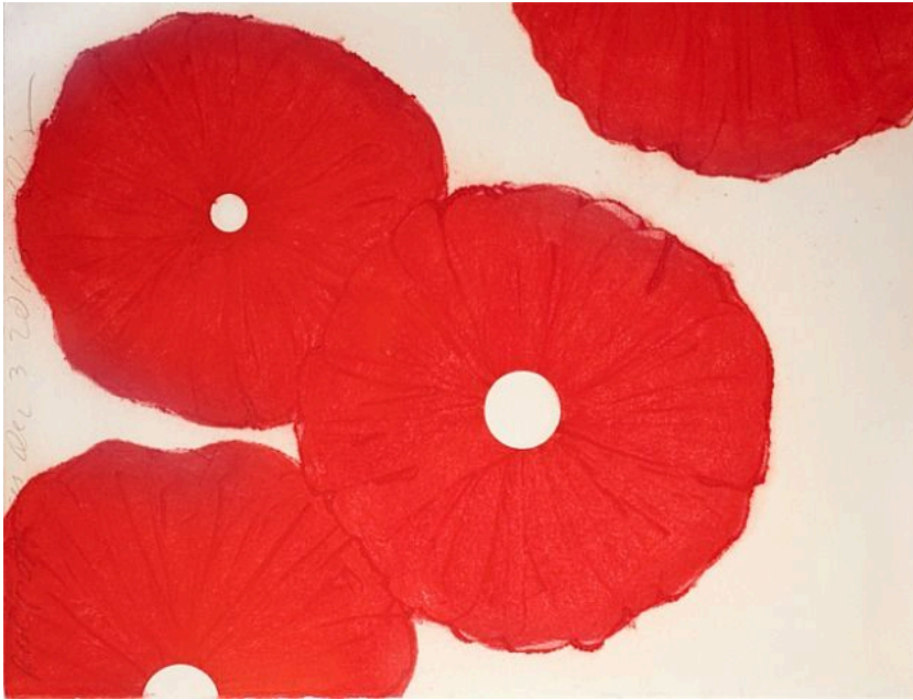
Donald Sultan, Red Poppies Dec 3, 2013

Sorokko Gallery is known for curating multidimensional and textured art that seem to come to life as you observe it. San Francisco is very lucky that the Donald Sultan exhibition has been extended to the end of July. Sultan is recognized for elevating the still-life tradition through the deconstruction of his subjects into basic forms and the use of industrial materials. This collection of over 20 original works includes an unveiling of new paintings and classics from the past decade, and marks the first time Sultan has shown in San Francisco in over 20 years.