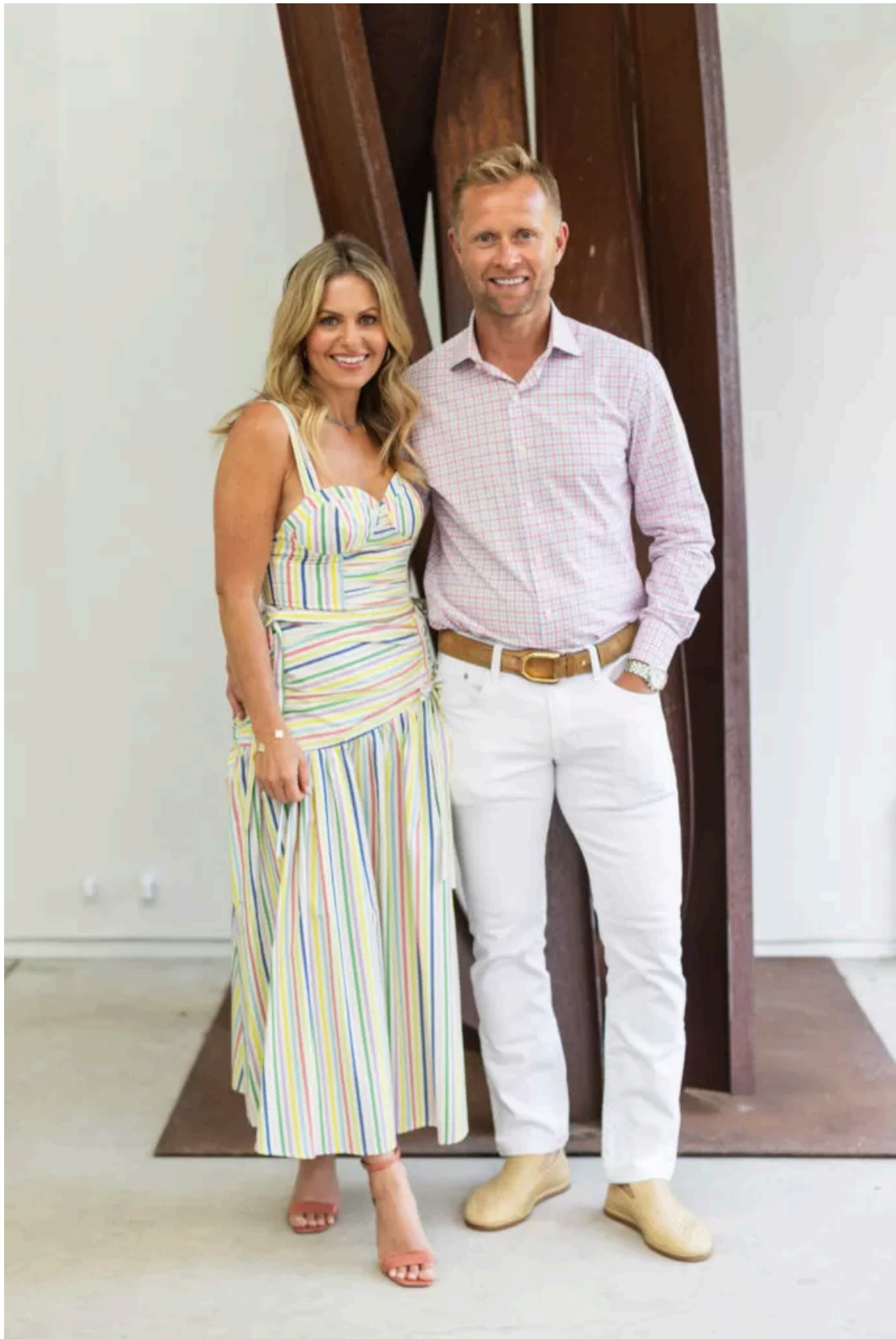
Candace Cameron Bure and Valeri Bure