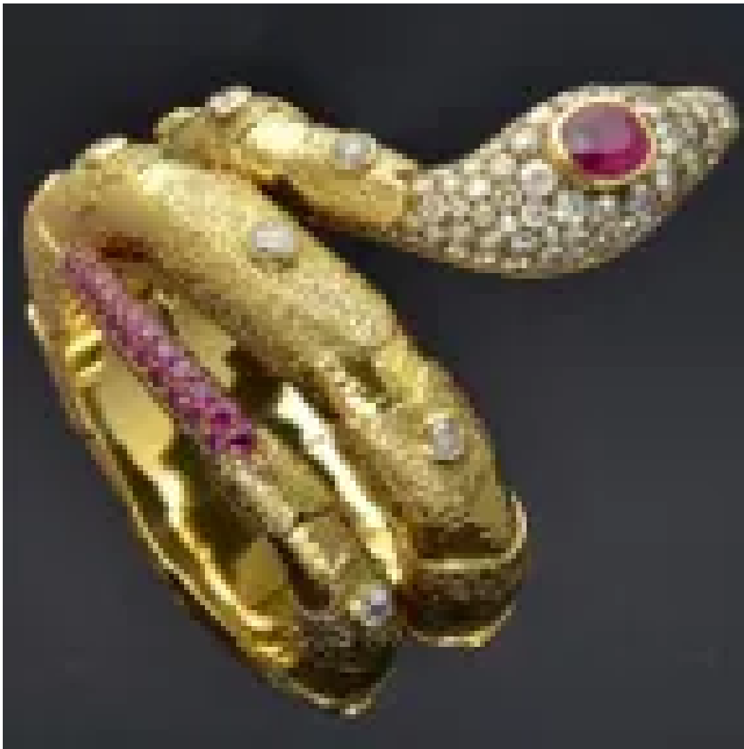
A.Codognato Bracelet

Recent royal British controversy over a Blackamoor brooch has added urgency to the display. Fifty iconic pieces in gold, platinum and precious stones reveal why the world's biggest style icons from Diana Vreeland to Jackie Kennedy Onassis, to the late Alexander McQueen were among the jeweler's avid fans flocking to his by-appointment only store during the Venetian Carnival, Biennale or the prestigious Venice film festival.