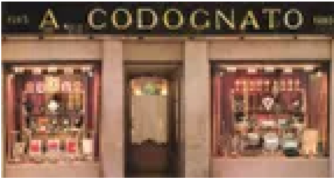
A.Codognato Storefront