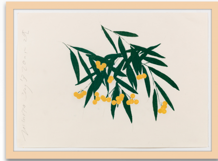
Mimosa Aug 13 2015 Graphite, gouache, and flock on paper 13 1/2" x 19 1/2"