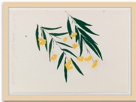
Mimosa July 23 2015 Graphite, gouache, and flock on paper 13 1/2" x 19 1/2"