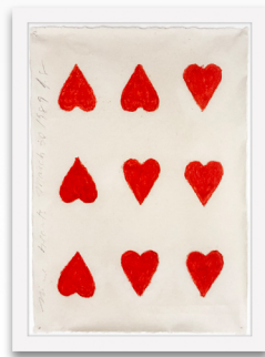
Nine Hearts March 30 1989 Conté on Auvergne a la Main paper 11 5/8" x 8"