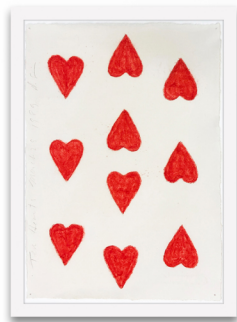
Ten Hearts March 23 1989 Conté on Auvergne a la Main paper 11 5/8" x 8"