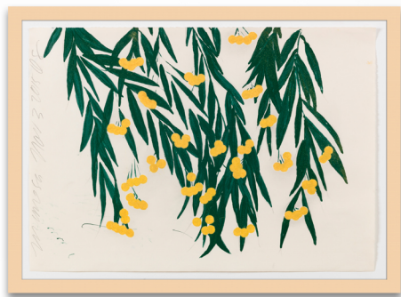
Mimosa Nov 3 2015 Graphite, gouache, and flock on paper 13 1/2" x 19 1/2"