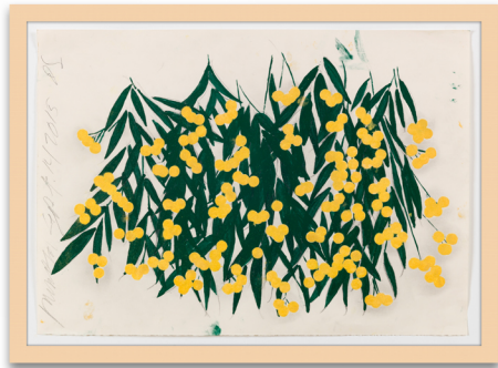
Mimosa Sept 14 2015 Graphite, gouache, and flock on paper 13 1/2" x 19 1/2"