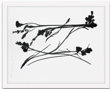
Freesia June 25 2018 Ink on paper 16" x 20" VIEW TO SCALE