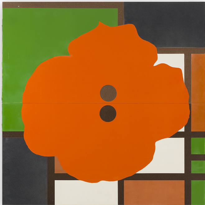
Orange Button December 17 2015 Enamel, flock, and oil over Masonite 72" x 72" VIEW TO SCALE