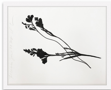
Freesia June 26 2018 Ink on paper 16" x 20" VIEW TO SCALE