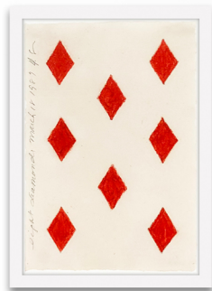
Eight Diamonds March 18 1989 Conté on Auvergne a la Main paper 11 5/8" x 8"