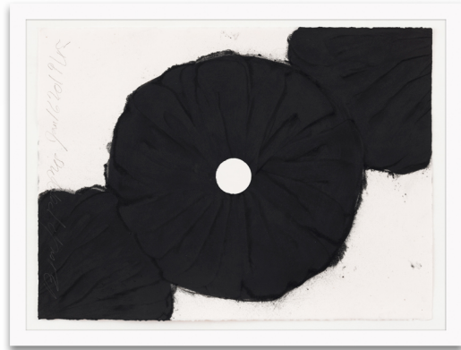
Black Poppies Jan 16 2019 Charcoal on paper 22" x 30" VIEW TO SCALE