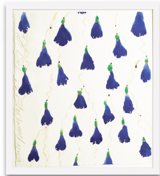
Wallflowers April 23 2007 Watercolor on paper 14 1/2" x 13" VIEW TO SCALE