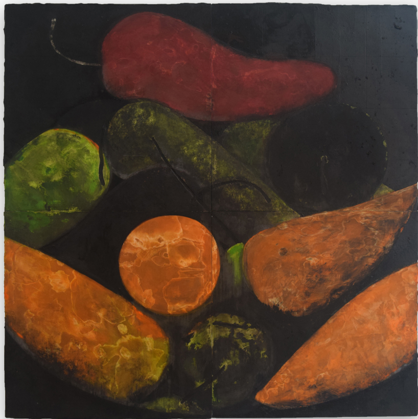
Peppers March 3 1989 Tar, spackle, latex and tile over Masonite 96" x 96" VIEW TO SCALE