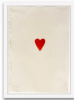
One Heart April 6 1989 Conté on Auvergne a la Main paper 11 5/8" x 8"