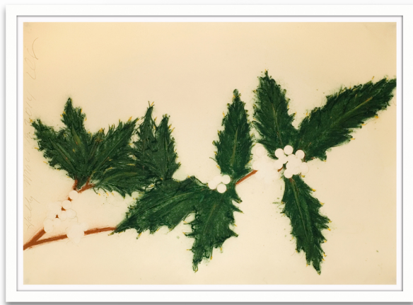
Holly March 19 2014 Conté on paper 27 1/2" x 39 1/2" VIEW TO SCALE