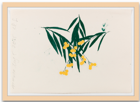
Mimosa Aug 5 2015 Graphite, gouache, and flock on paper 13 1/2" x 19 1/2"