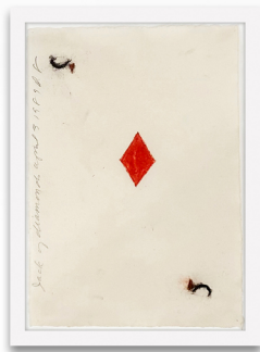
Jack of Diamonds April 3 1989 Conté on Auvergne a la Main paper 11 5/8" x 8" VIEW TO SCALE