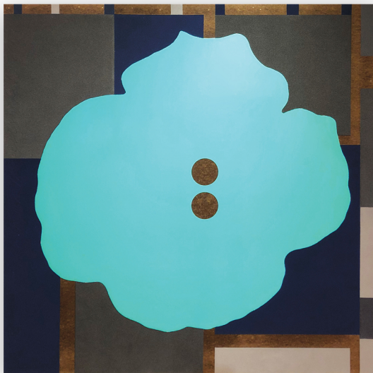
Button Down Modernism Feb 1 2017 Enamel and flock over Masonite 48" x 48" VIEW TO SCALE