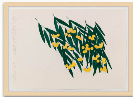
Mimosa Sept 20 2015 Graphite, gouache, and flock on paper 13 1/2" x 19 1/2"