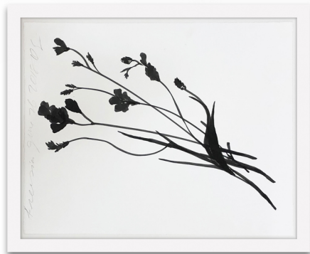
Freesia June 26 2018 Ink on paper 16" x 20" VIEW TO SCALE