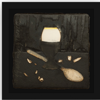
Egg and Cup May 12 2012 Oil, spackle, and tar on tile over Masonite 12 1/2" x 12 1/2" VIEW TO SCALE