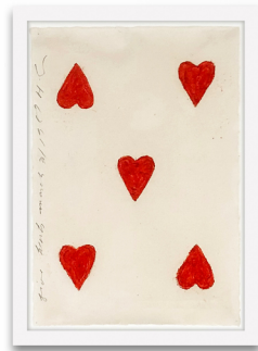
Five Hearts March 31 1989 Conté on Auvergne a la Main paper 11 5/8" x 8"