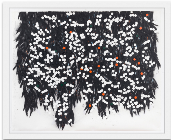
Mimosa With Green and Orange April 24 2018 Charcoal, conté, stickers, and enamel on paper 48 1/2" x 60" VIEW TO SCALE