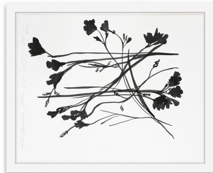
Freesia June 26 2018 Ink on paper 16" x 20" VIEW TO SCALE