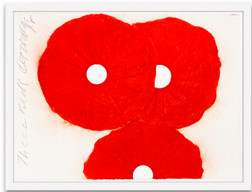
Three Reds Oct 24 2018 Conté on paper 22" x 30" VIEW TO SCALE