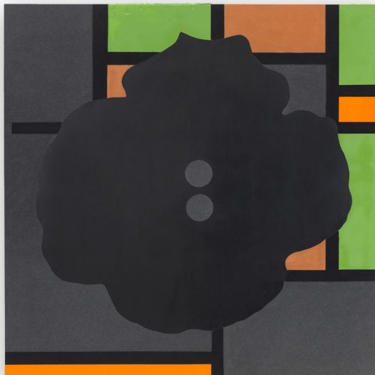
Button Down Modernism Black June 12 2016 Oil, enamel and flock over Masonite 48" x 48" VIEW TO SCALE