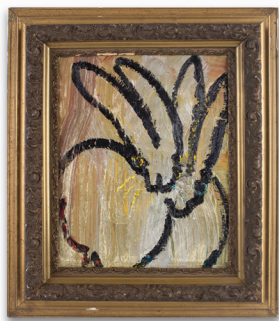
Untitled 2016 Oil on wood 20" x 16" VIEW TO SCALE