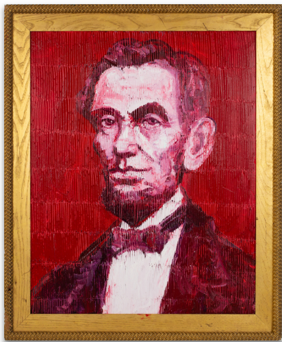
Lincoln 2018 Oil on wood 35" x 27 1/2" VIEW TO SCALE