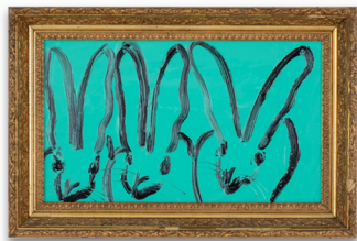
Three Sisters 2019 Oil on wood 12" x 20" VIEW TO SCALE