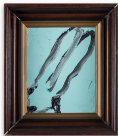
Untitled (Bunny) 2016 Oil on wood 10" x 8"