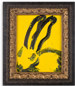
Untitled 2015 Oil on wood 10" x 8"