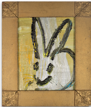
Untitled 2014 Oil on wood 13" x 10 1/2" VIEW TO SCALE