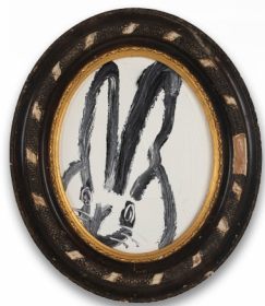
Untitled 2019 Oil on wood 10" x 8"