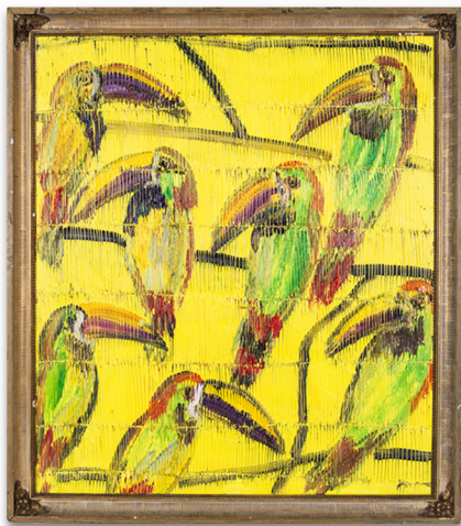
Untitled 2017 Oil on wood 35" x 30" VIEW TO SCALE