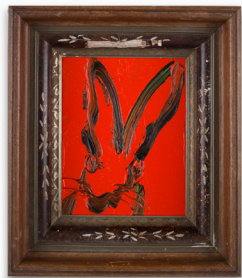
Untitled 2015 Oil on wood 10" x 8"