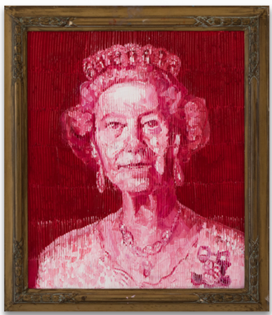
Queen Elizabeth II 2019 Oil on wood 26" x 22" VIEW TO SCALE