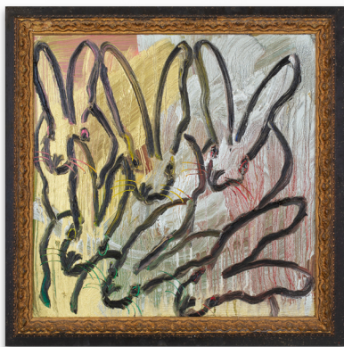
Golden Bunnies 2018 Oil on wood 24" x 24" VIEW TO SCALE