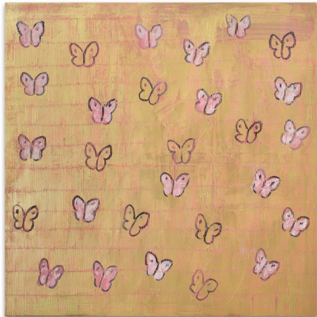
Untitled 2018 Oil on canvas 60" x 60" VIEW TO SCALE