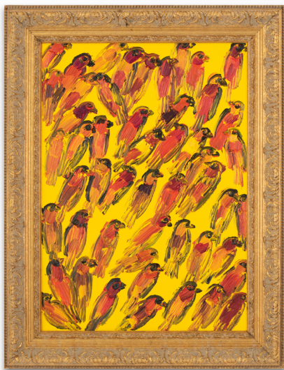
Orange Bishops 2019 Oil on wood 27 1/2" x 19 1/2" VIEW TO SCALE