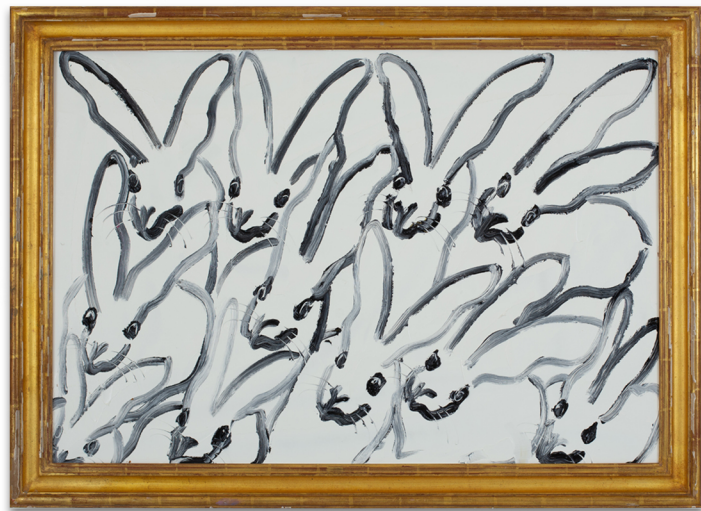
White Rabbits 2018 Oil on wood 27" x 39" VIEW TO SCALE