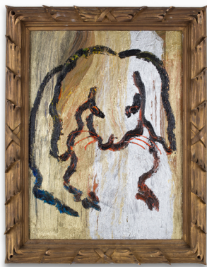
Untitled 2015 Oil on wood 24 1/2" x 18 1/2" VIEW TO SCALE