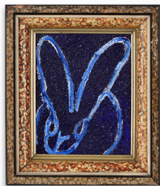
Untitled 2019 Oil and acrylic on wood with diamond dust 10" x 8"