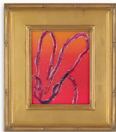
Untitled 2019 Oil and acrylic on wood with diamond dust 10" x 8"