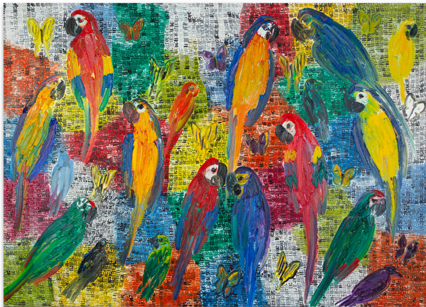
Oriente Local 2018 Oil on canvas 60" x 84" VIEW TO SCALE